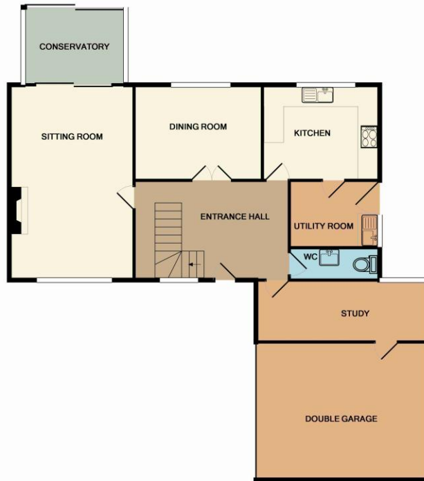
GROUND FLOOR APPROX. FLOOR AREA 111.6 SQ.M. (1201 SQ.FT.)