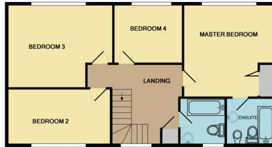
1ST FLOOR APPROX. FLOOR AREA 70.3 SQ.M. (757 SQ.FT.)

TOTAL APPROX. FLOOR AREA 181.9 SQ.M. (1958 SQ.FT.)